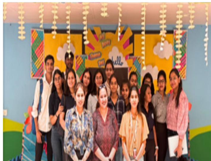
Creative minds of tomorrow, gain insight today”

Students form Galgotias School of Design recently undertook an enriching academic visit to Little Illusion Preschool,