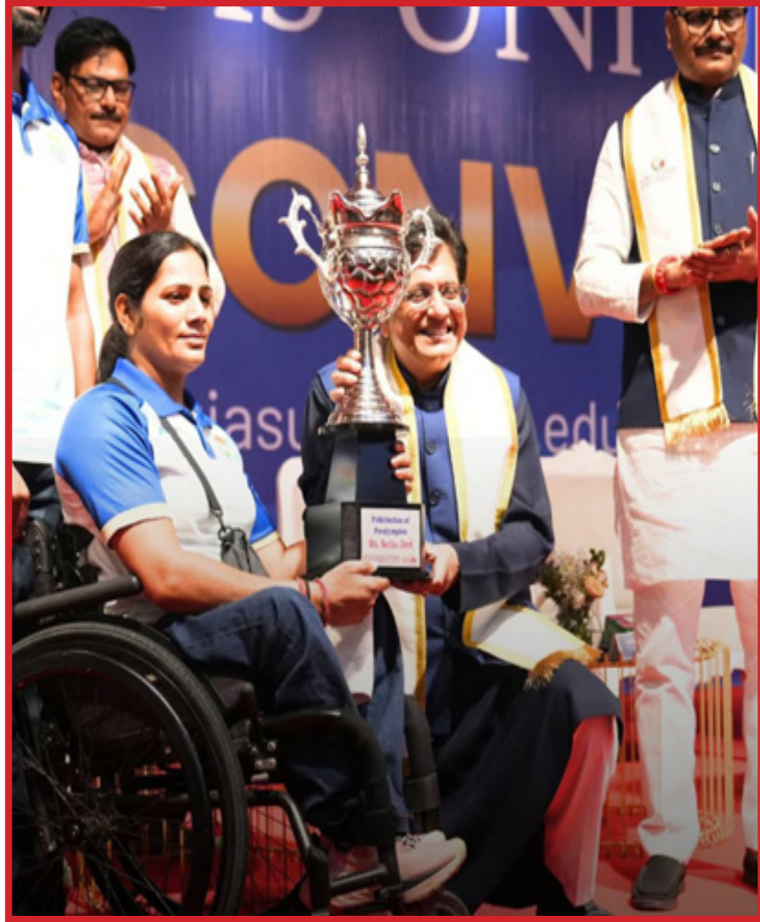
A Visionary Leader at Galgotias: Shri Piyush Goyal Inspires the 9th Convocation.