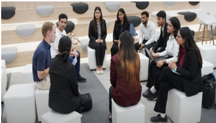
(Harvard students and galgotias student exchanging words on their project)

global leadership role. The discussions emphasized the importance of global academic collaboration and highlighted Galgotias University's growing role in