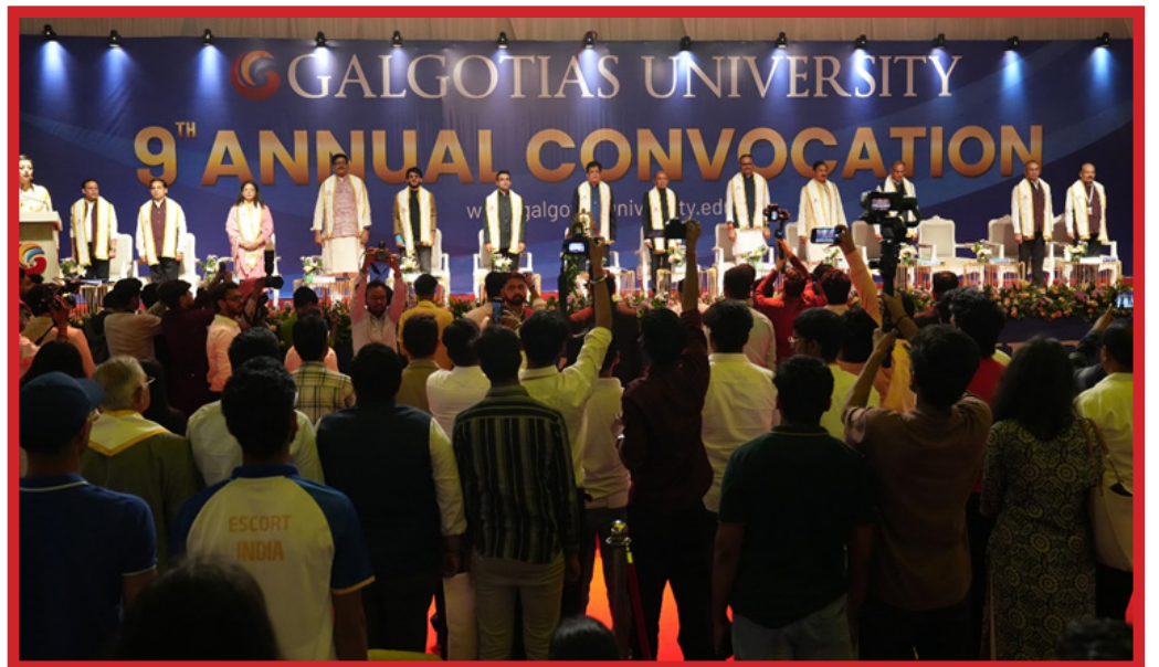
Guests received an esteemed welcome from the attendees.