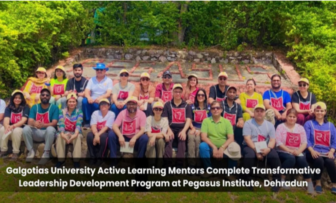
Active Learning Mentors Complete Transformative Leadership Development Program”

Galgotias University’s active learning mentors have completed a leadership development program at Pegasus Institute, Dehradun, a significant milestone in faculty development initiatives. The program, which emphasizes practical learning, team building,