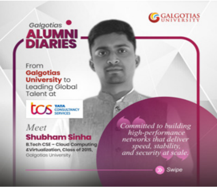
Galgotias alumnus shines bright”

back in 2015 when digital technologies were in their fetal stage. Provision of extensive computing resources, well designed curricula, fully flexible credit system and specialized equipment for individual research efforts enable students at Galgotias University to acquire relevant knowledge and skills while providing flexibility in