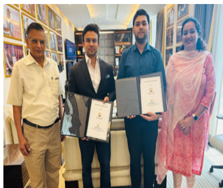
"A partnership of commitment and revolution"

through research backed proposals. This makes it the perfect learning partner for students at Galgotias university where 'active learning' education