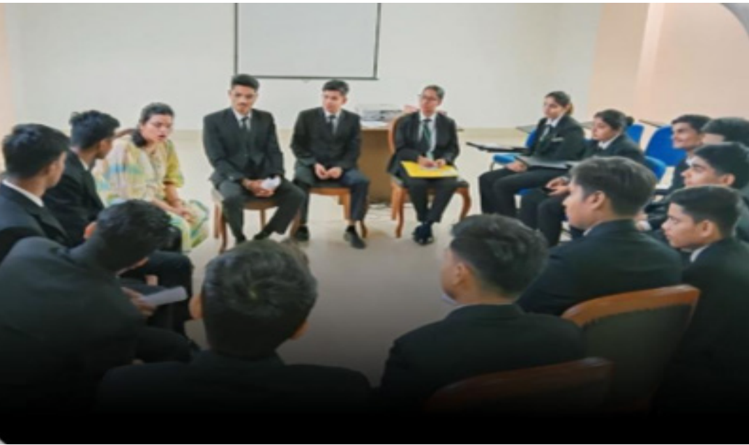
Leaders of tomorrow with Domain experts"

Students from the school of Hospitality (SOHT) at Galgotias University have been selected by Jaypee Greens Golf & Spa Resort, Greater Noida for Industrial Training. In line with the new education policy, industrial training is mandatory for students. This ensures that the next generation workforce is industry ready. Proving their excellence and professional