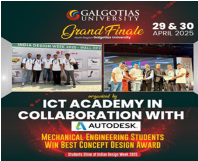
Mechanical Engineering students shine at India Design Week 2025

Galgotias University’s Mechanical Engineering students won the Best Concept Design award in a