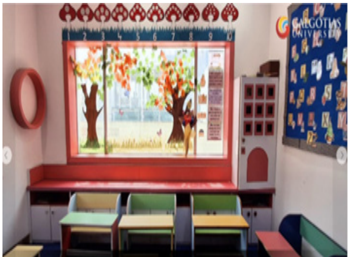
Observing spatial, sensory, and functional aspects of pre-school designing”

they observed key design elements such as safety measures, age-appropriate scaling, colour psychology, material choices, and interactive learning zones. This broadened their perspective on how design influences early education. This experience not only deepened their understanding of child-centric interiors but also sparked creative inspiration for their ongoing design projects.