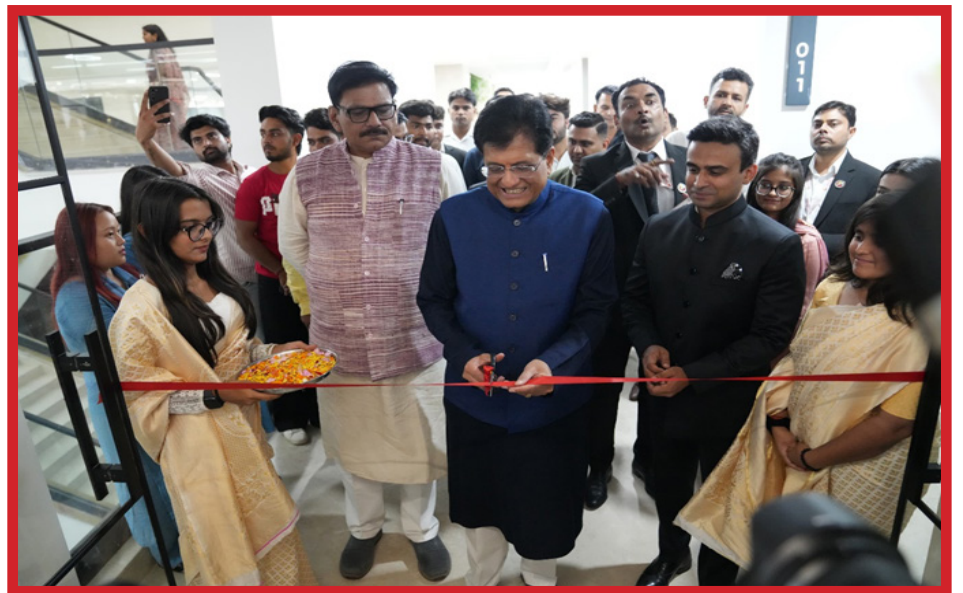
Honourable Union Minister Mr. Piyush Goyal authenticated the ribbon cutting ceremony in the AI - DS Block of Galgotias University.