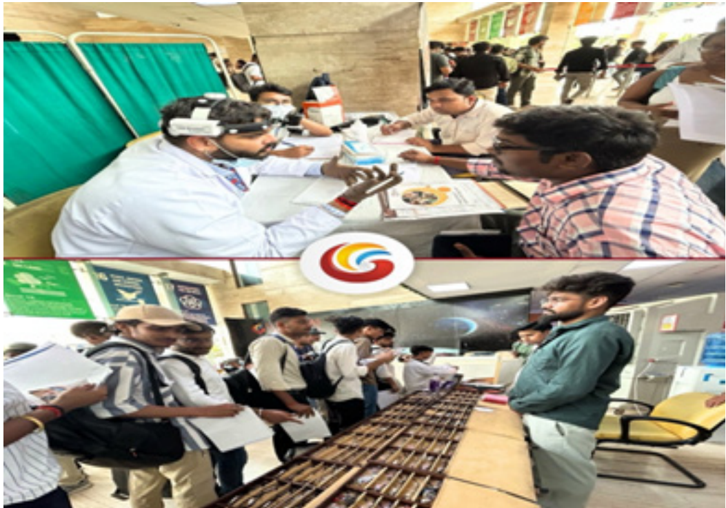
“Students are engaging with experts

The event provided free health check-ups and screenings, facilitating early detection of cancer, potentially saving lives. It fostered community engagement and empowered individuals to make informed decisions about their health. The camp promotes health and wellness, aligning with Galgotias University’s commitment to a healthy society. It has the potential to reduce cancer-related mortality rates and build trust and credibility. The event’s success may inspire future initiatives and improve community health outcomes, potentially reducing cancer-related mortality rates and improving overall health.