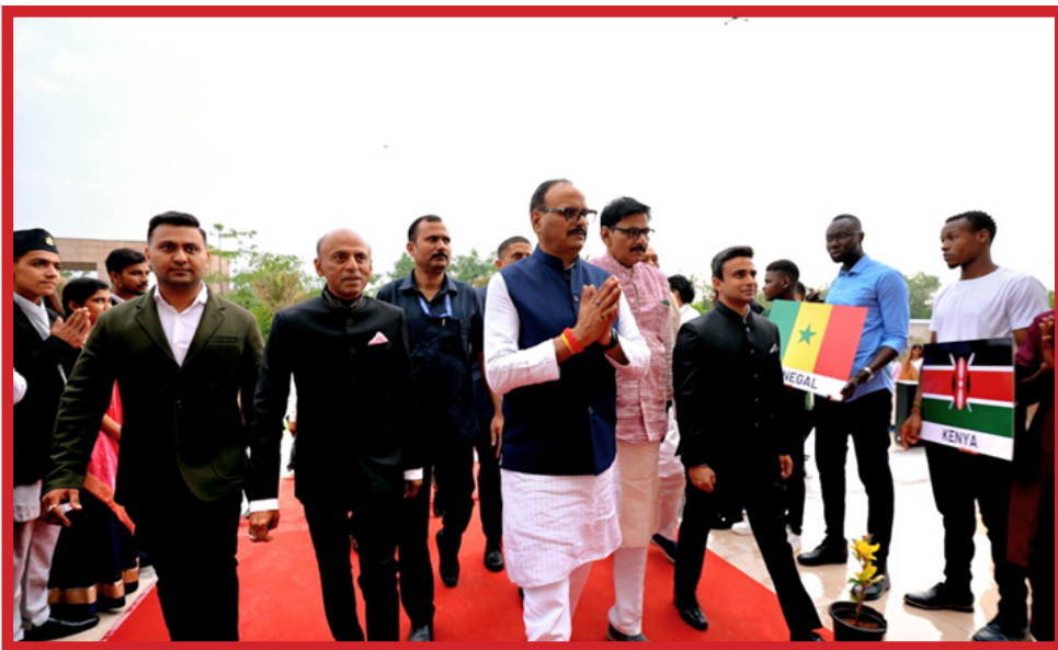
Students from different Nations welcome the Honourable Deputy CM Mr. Brajesh Pathak.