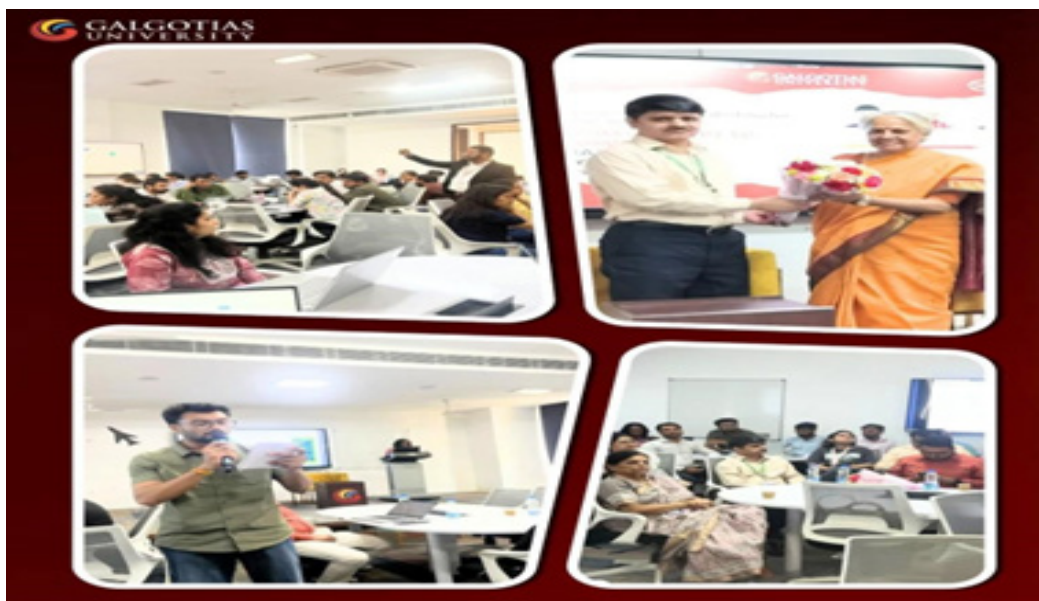
(The event featured expert talks, interactive sessions, and practical guidance aimed at enhancing research writing skills among doctoral scholars.)