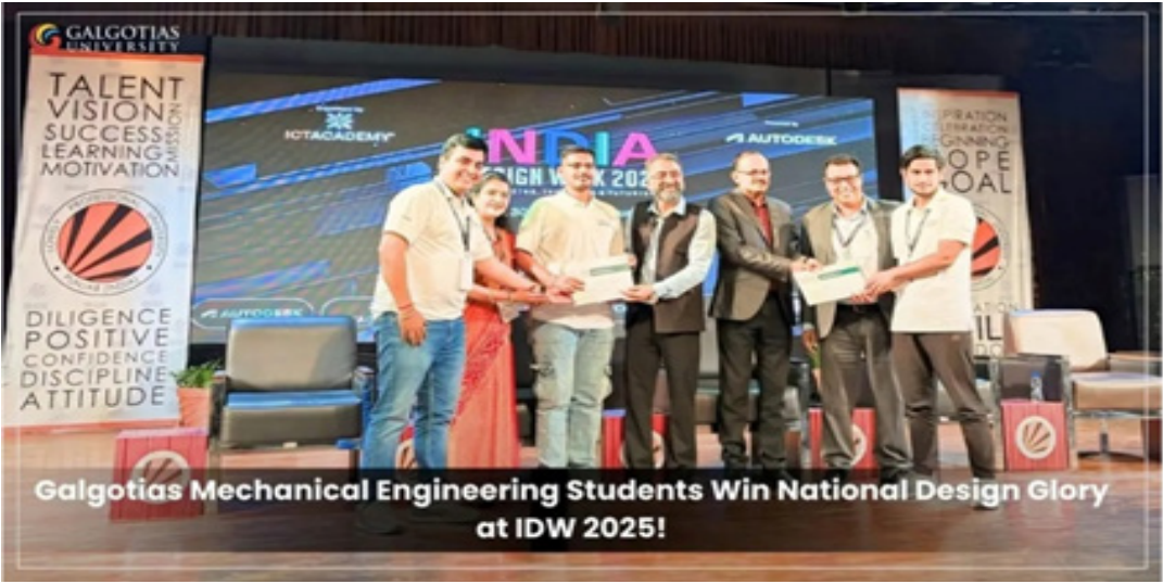
Galgotias Mechanical Engineering Win National Design Glory at IDW 2025