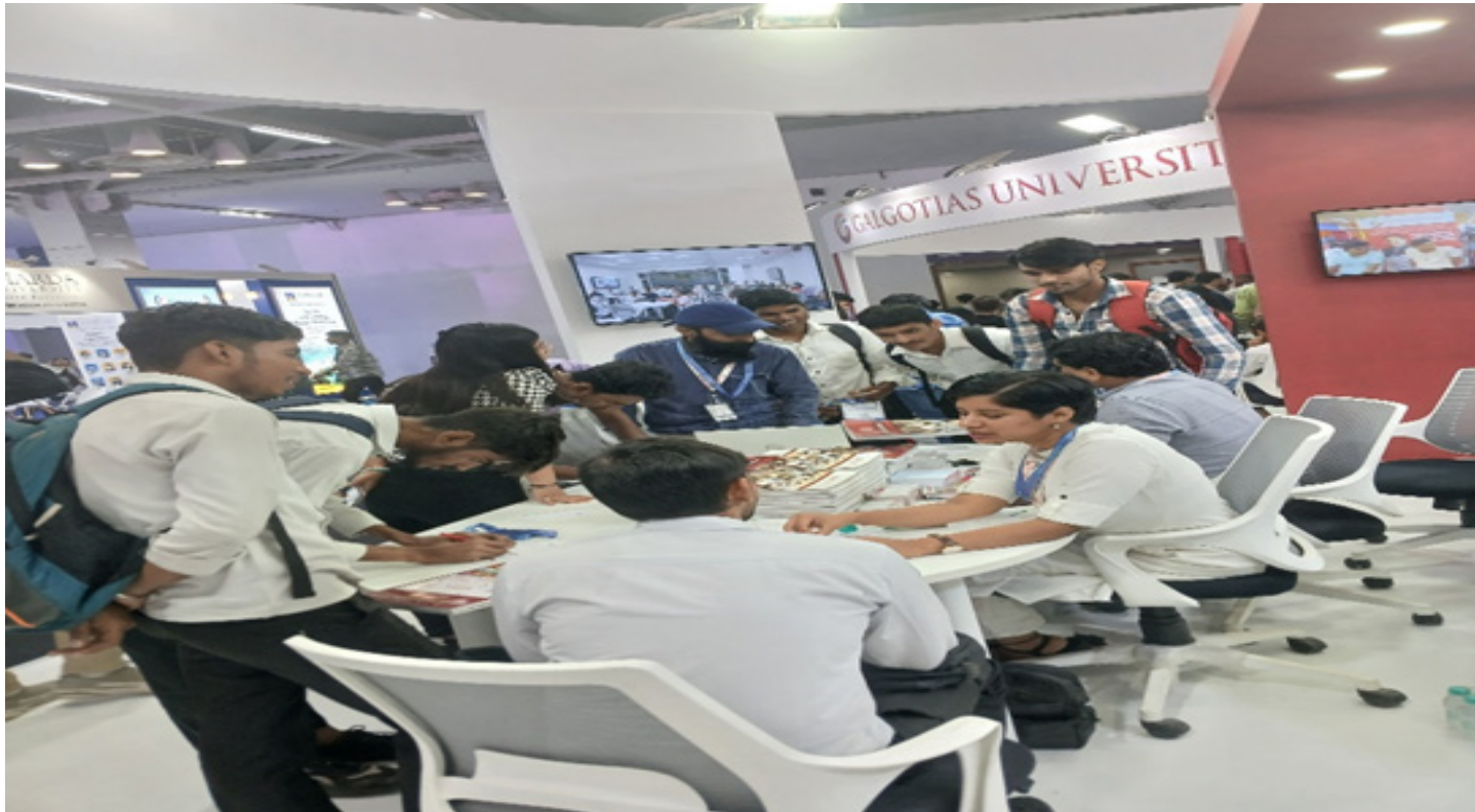
Active Learning Ecosystem

approaches to education, shared best practices, and networked with other educators and industry leaders.