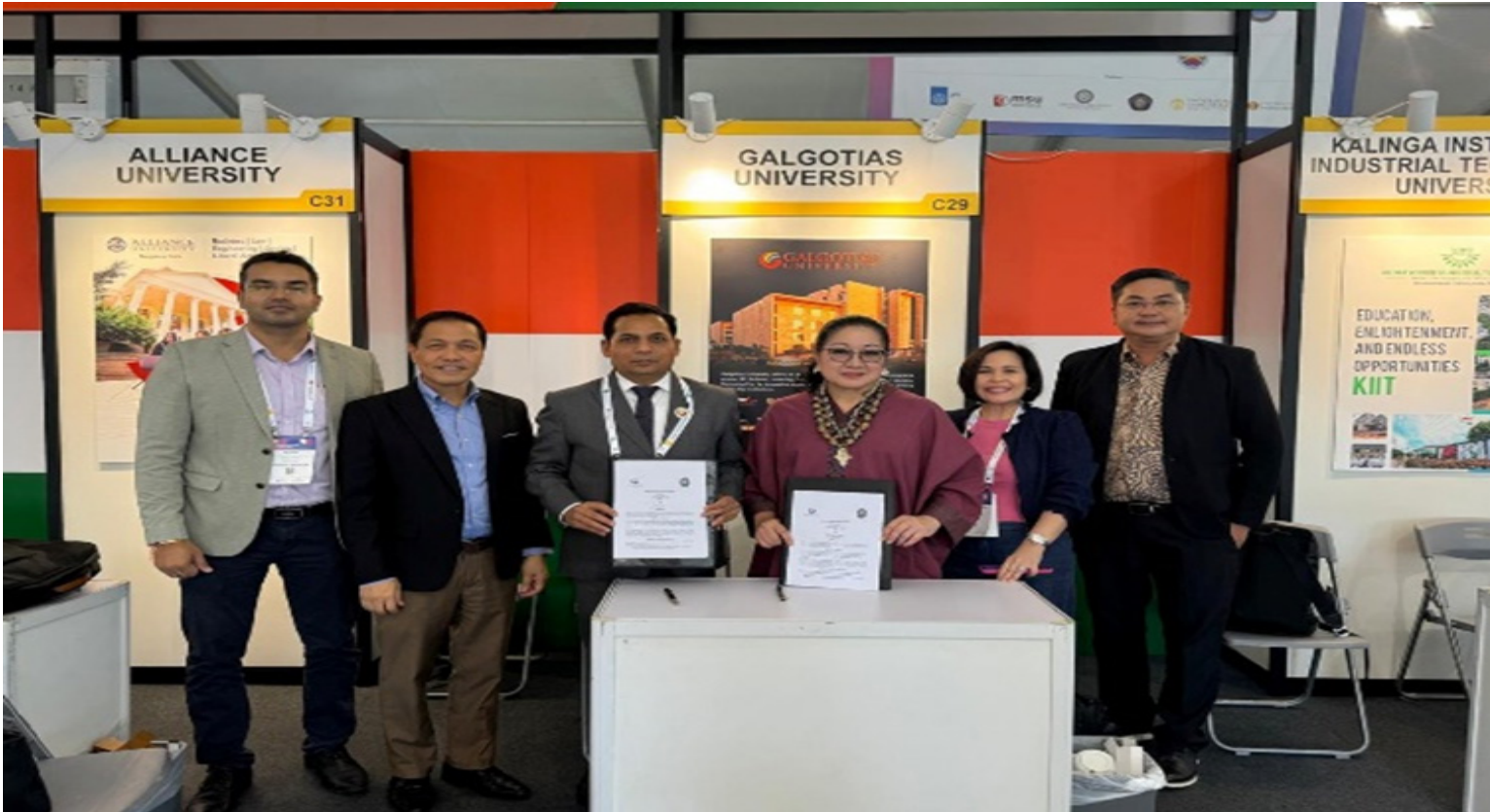
Future shaping higher education

and renewed inspiration, we look forward to shaping the future of higher education. An important contribution was to talk about creative ideas and cooperative approaches in higher education. Known for its expertise in research, and innovation capabilities,