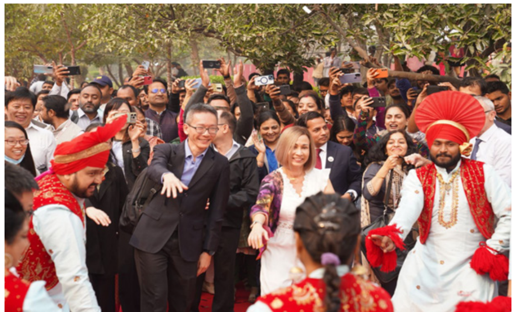
Welcoming the delegation with the Indian tradition