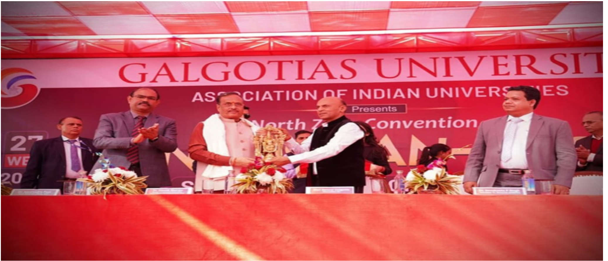
Chancellor of Galgotias university facilitates memento to the Dinesh Sharma former deputy chief minister

This event is about to give a platform for students to present their innovation research projects and foster meaningful academic discussions. More than 40 universities have come forward to participate with 700+ students in the event. On November 26 and 27, 2024; Galgotias University hosted this event to highlight the innovative research conducted by students and foster connections within the academic community. Galgotias University has been focusing on promoting innovation and research among its students, and its participation in Anveshan 2024 is a testament to this commitment. The university has established various initiatives to support student research and innovation, including funding for research projects and mentorship programs. The convention was