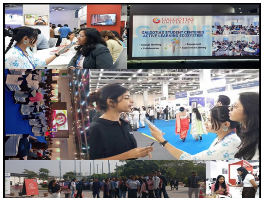
Active participation of the educators and students during the event

electric solar bus, which was crafted by the university's B-tech students. The solar bus is part of the University's commitment that it promotes sustainability and innovation in student-led projects. One of the key highlights of the University's initiatives is its active learning ecosystem, where innovative strategies are integrated with traditional teaching methods. Students are not only encouraged to think critically, but also engage in the real-world projects that