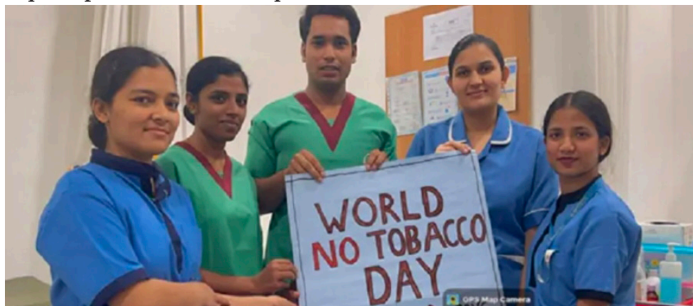
Students presenting their posters on the day.