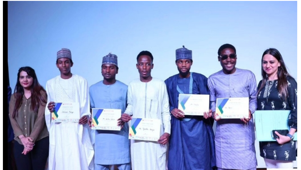
Certificate distribution by the hosts