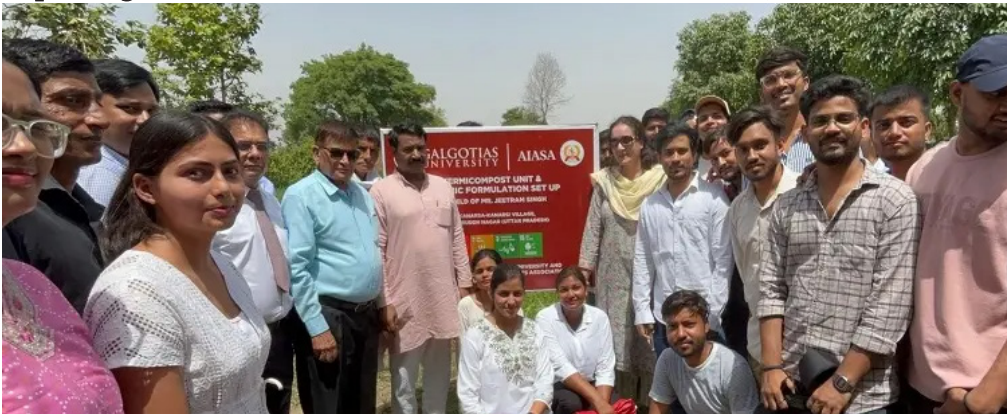
Students taking training program in the village of Kanarsa Kanarsi.

represent a significant milestone in the journey towards sustainable agriculture, providing a model that can inspire similar efforts across the country. By integrating academic knowledge with practical farming techniques, this initiative paves the way for a greener, more sustainable future. To the students involved in this initiative, knows that their efforts are laying the groundwork for a more sustainable world. Their innovation, dedication, and hard work are not only transforming local communities but also setting a precedent for sustainable agricultural practices nationwide. Continue to strive for excellence, and know that your contributions are making a significant difference in the world. Your journey is just beginning, and the impact of your work will be felt for generations to come.