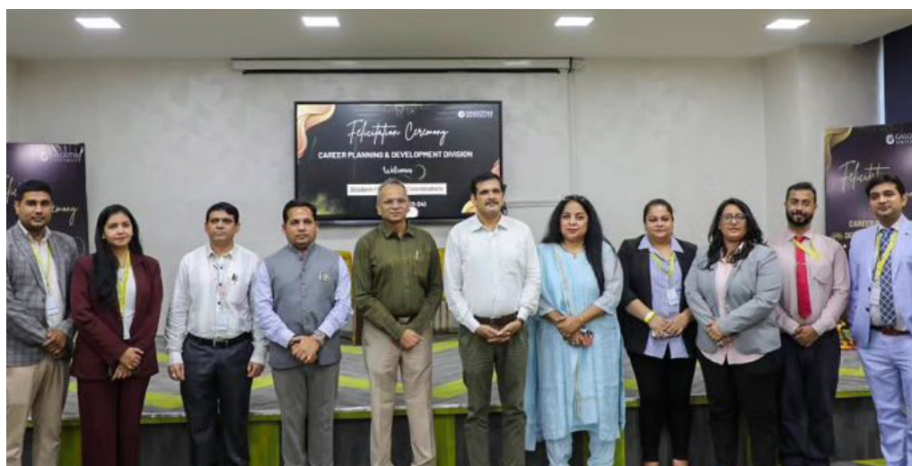
Chief guests of the event

belief to make their mark on the global stage. As the event came to an end, the auditorium emptied, but the echoes of celebration lingered. The Felicitation Ceremony served as a beautiful reminder that success is not only measured by placements but by the unwavering spirit, determination, and resilience that make the way for those achievements. Galgotias University and its esteemed educational institutions have once again demonstrated their commitment to nurturing and empowering the leaders of tomorrow. As the Batch of 2024 embarks on their respective journeys, they carry with them the invaluable lessons, memories, and the indelible mark of the Galgotias experience, poised to conquer new horizons and leave an indelible impact on the world.