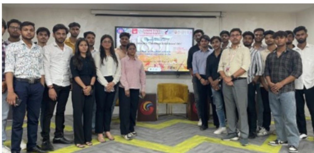
Group photos of all the NSS members

values of freedom and justice. The success of this event is an example of true dedication and hard work of the entire team. The commemorative event at Galgotias University not only celebrated the historical significance of the 1857 rebellion but also served as a reminder of the enduring values of freedom and justice. This event served as an appropriate tribute to the heroes of 1857 and a powerful reminder of the importance of understanding and preserving our history.