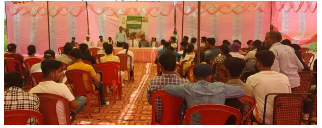
Students interacting with the members of AIASA-UP