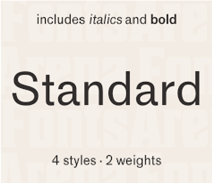
Standard: a versatile font