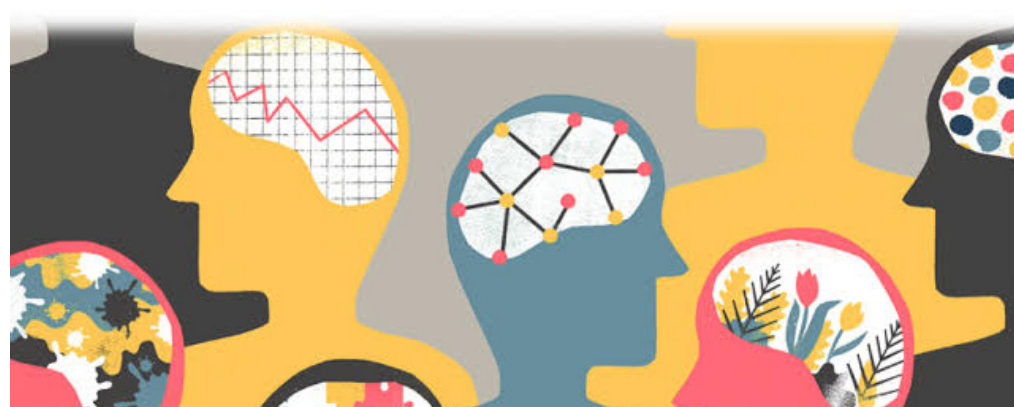
Overthinking plays a major role in harming mental health.