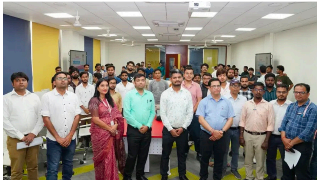
A photo with all the faculty members