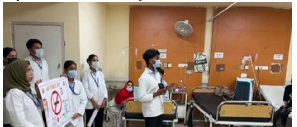
A great initiative taken by students of Galgotias University.