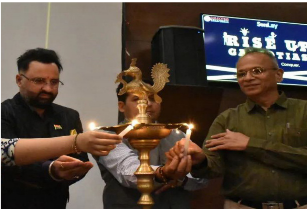
Lamp lighting ceremony with the leaders