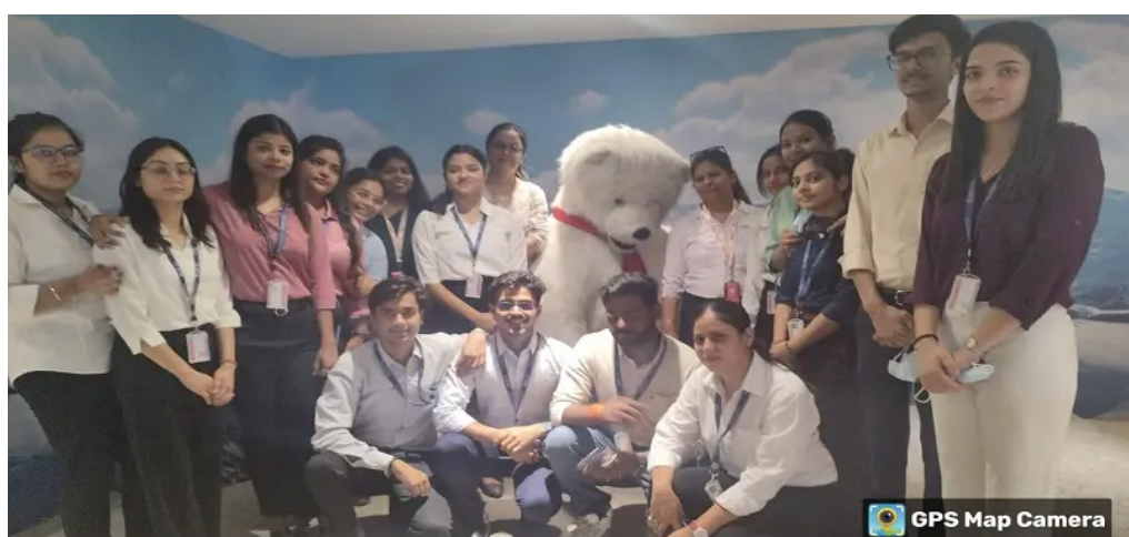
Students of School of Business have an industrial visit to Moon Beverages production.