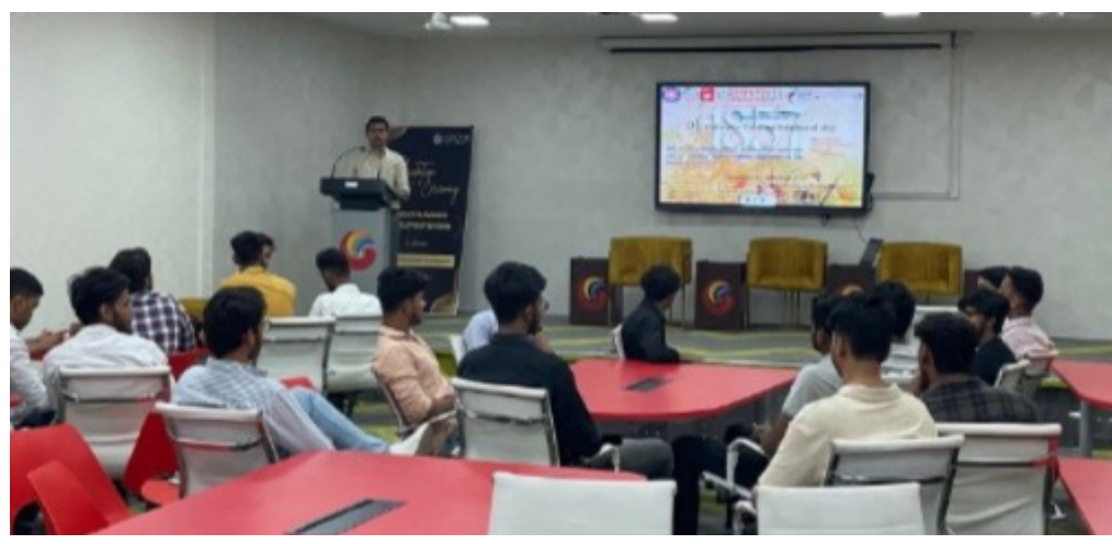
departmental coordinators sharing their insight