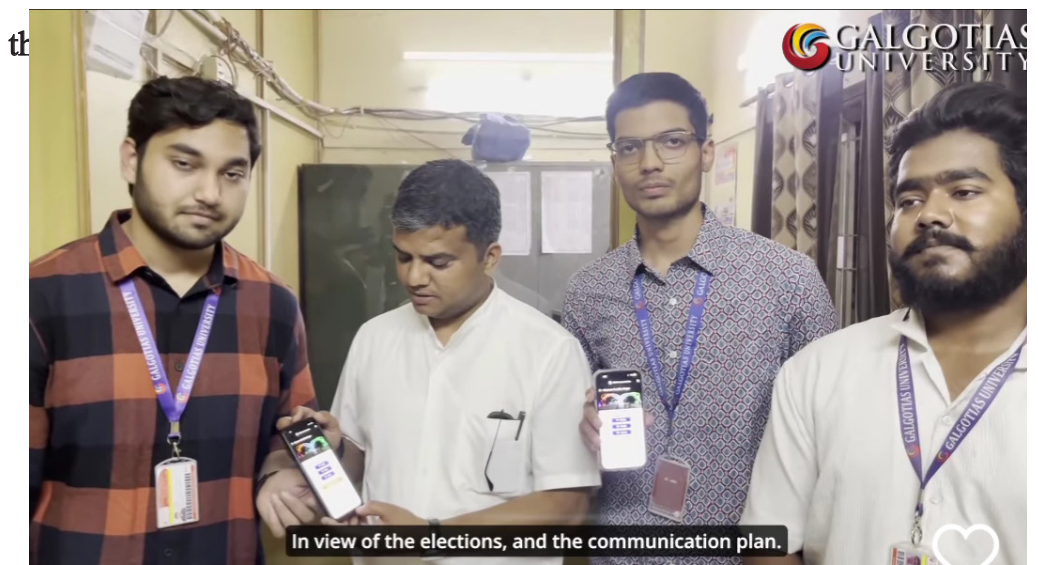
In view of the elections, and the communication plan.